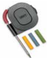
Weber Meat Probe Either replace an existing meat probe or add a couple more. 7211