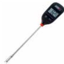
Instant Read Thermometer The large digital display reads the internal meat temperature accurately in a matter of seconds. 6750