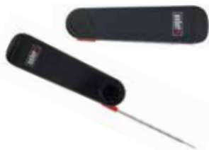
Snapcheck™ Grilling Thermometer Super-fast and accurate to within 1°C. The Snapcheck thermometer is the ultimate instant thermometer. 6752