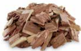
Smoking Wood Chips Available in pecan, hickory, apple, cherry or mesquite smoking woods. 3000cm 3