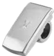
Grill 'n Go Light A multifunctional barbecue light that easily attaches to the barbecue handle. 7662