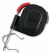
Weber Ambient Probe This durable, stainless steel probe clips onto your grill to provide exact ambient temperature tracking. 7212