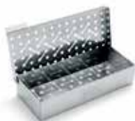
Universal Smoker Box This smoker box has a hinged lid with a large tab allowing you to easily add wood chips during the cooking process. 7576