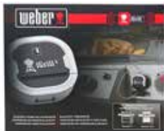
iGrill® 3 Monitors food and notifies you on your smart device once it is cooked to your liking. 7204