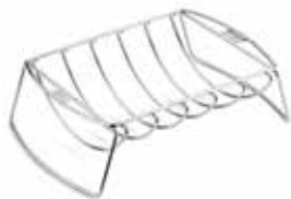
Weber Reversible Rib & Roast Holder Heavy gauge, nickel plated steel rib and roast rack creates up to 50% more usable cooking area. 6469