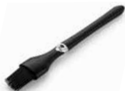
Silicone Basting Brush Removable silicone bristles are easy to clean and will not shed, stain or retain odours. 6661